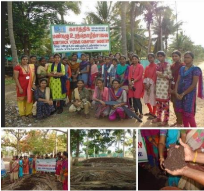
Karthick Vermicompost Industry, Vadipatti, Madurai -14.09.2019