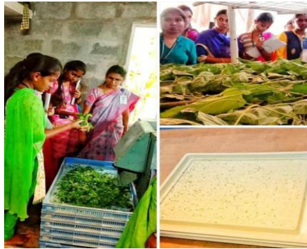
Silkworm rearing techniques, Sekar Serifarm, Athani- 06.09.2019