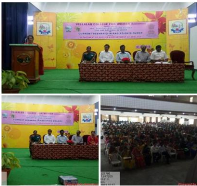
National Seminar on Current Scenario in Radiation Biology- 07.08.2019