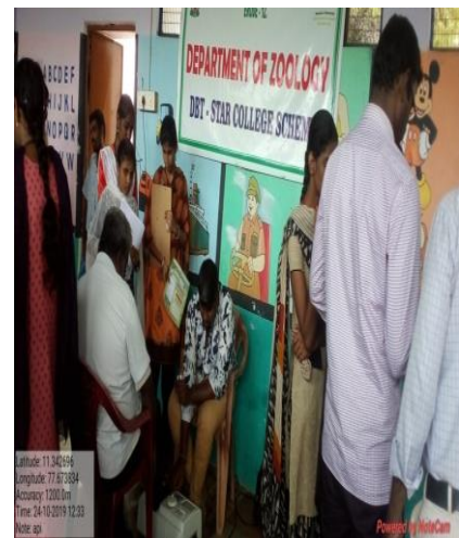
Body Composition Analysis and Early Diagnosis of Osteoporosis for Teaching, Non teaching & people at adopted village -23.10.19 & 24.10.19