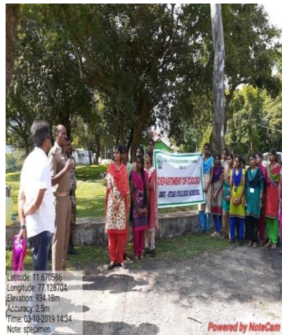
Visit to Sathyamangalam- Tiger Reserve