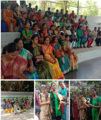
Nilgiri Biosphere Reserve, Anaikatti, 17.07.2019