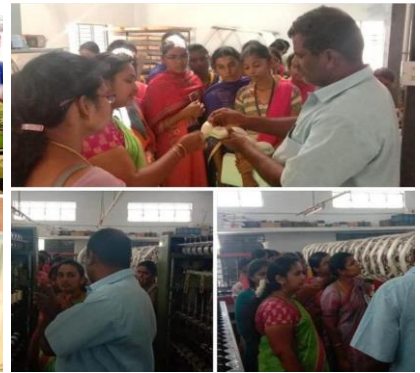
Silk reeling technique, Sarvodhya Sangh, Tiruppur - 07.09.2019