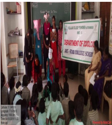
Role Play on Wildlife conservation