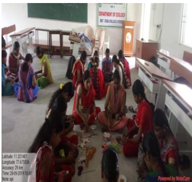
Training on Fashionable Handicrafts from silkworm cocoon wastes & Exhibits by Students 27.9.2019 & 28.09.2019