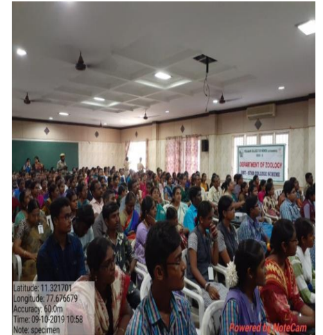
Meeting by Officials, Forest Department, Erode