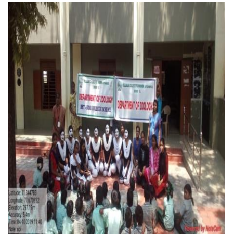
Mime on wild life conservation at P.U.E Villarasampatti School, Erode