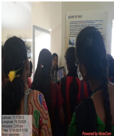
Seri Tourism Centre- Silk World - 12.10.2019