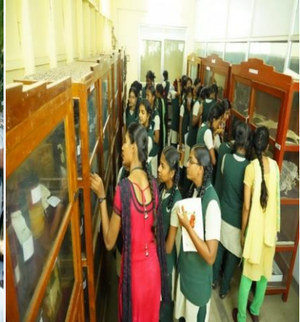
Training on Vermitechnology and Apiculture & Visit to Museum & Observing Specimens, Zoology Department, 06.09.2019