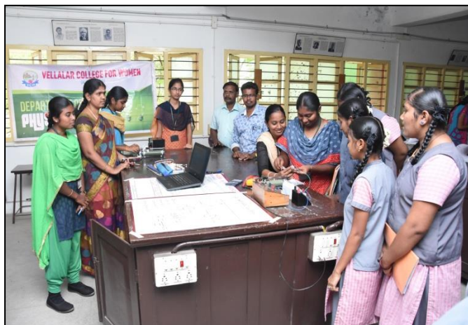
III B.Sc., students providing Hands-on Training in practicals to X standard Thindal Government School students 12.02.2020