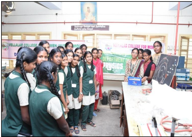
Two Day Lecture Workshop for Graduates in Physics through problem solving techniques for higher education 03.03.2020 & 04.03.2020