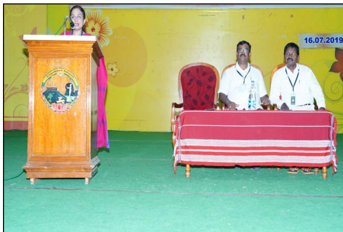
Career opportunity programme on “Physics – Career – Lifestyle” 16.7.2019