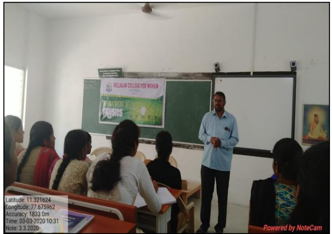
Two Day Guest Lecture Programme on Quantitative Aptitude & Logical reasoning skills for Competitive Exams 29.02.2020 & 07.03.2020