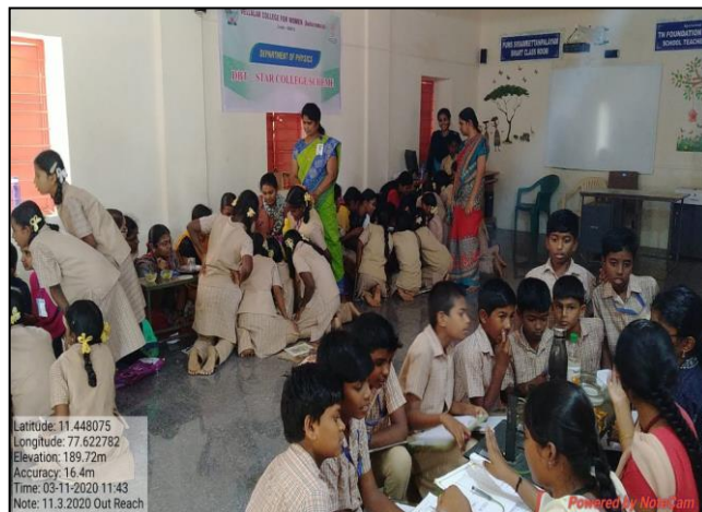
Science is fun and pride –demonstration of basic science experiments 11.03.2020