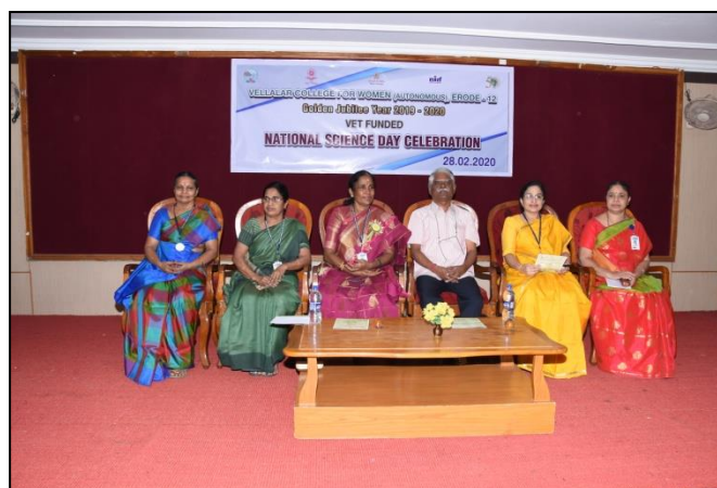
National Science day celebration 28.02.2020