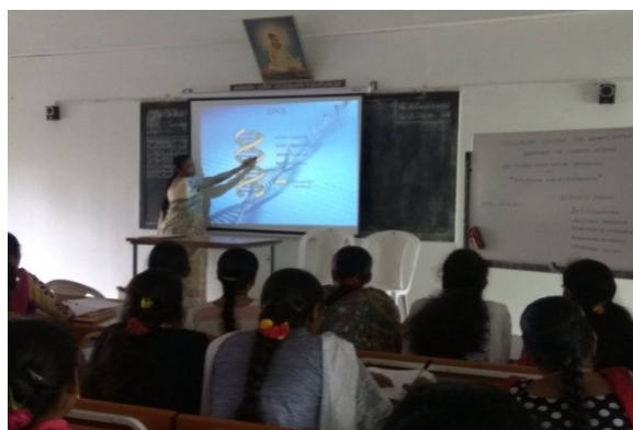
DBT Funded Guest Lecture on Data Mining and Bioinformatics