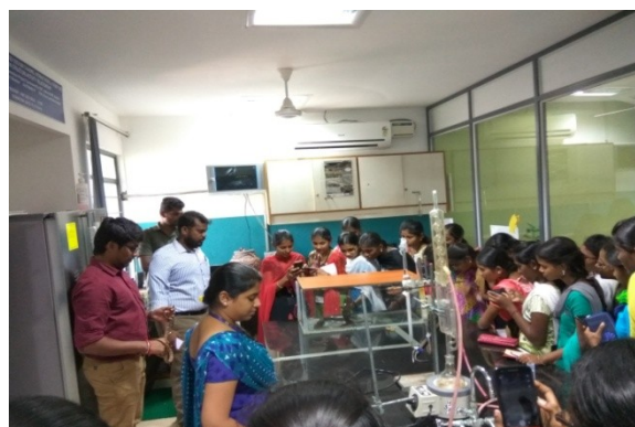
DBT Funded - Workshop on Data Analytics on Bioinformatics Using Biopython