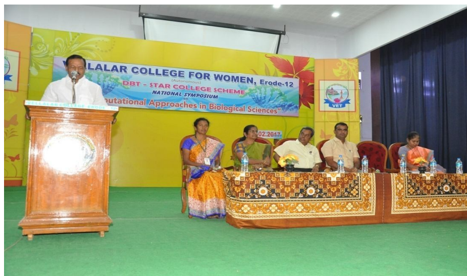
National Symposium on Computational Approaches in Biological Sciences