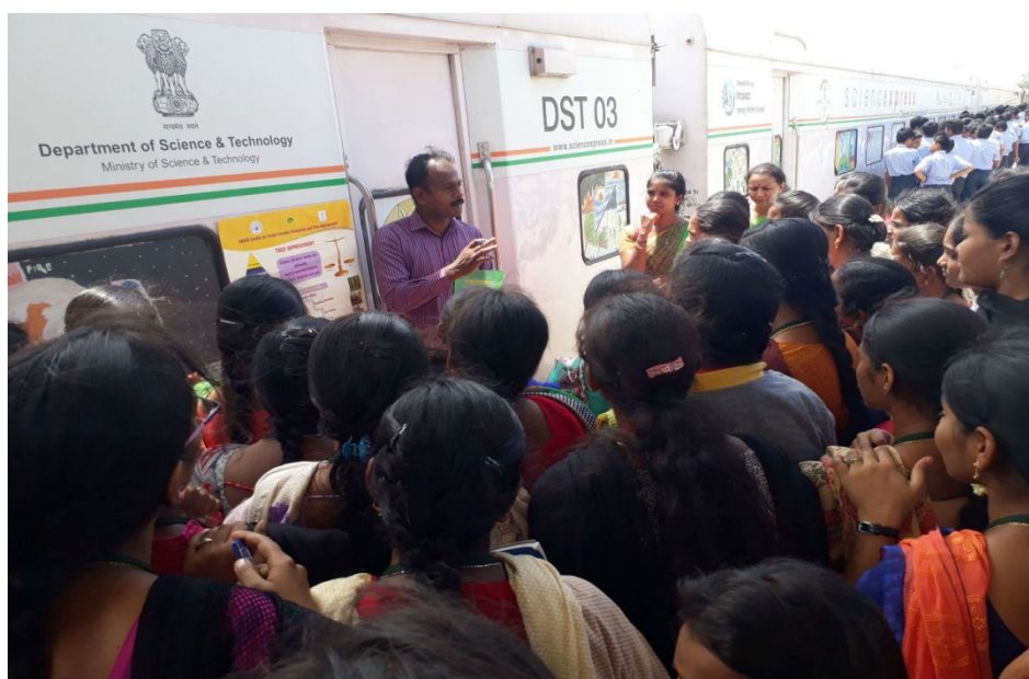
'Science Express Climate Action Special' (SECAS) Exhibition Train at Karur