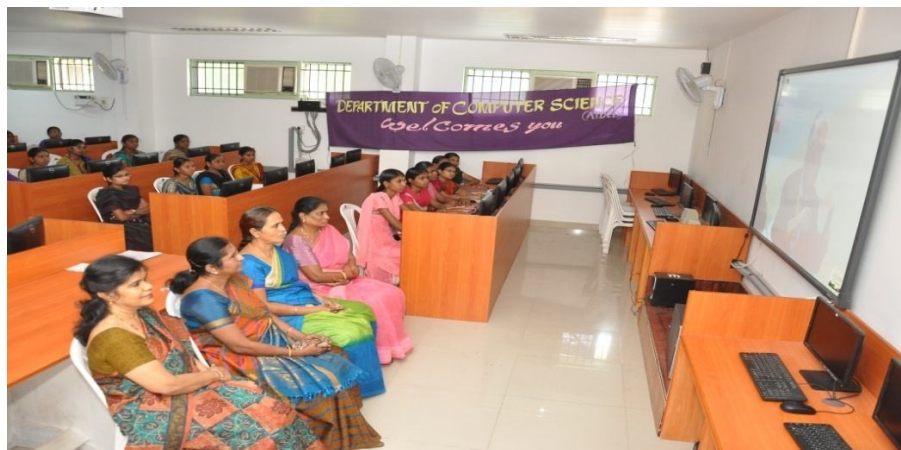
DBT-Live streaming session on “Nobel Prize Series India” by Nobel Laureates