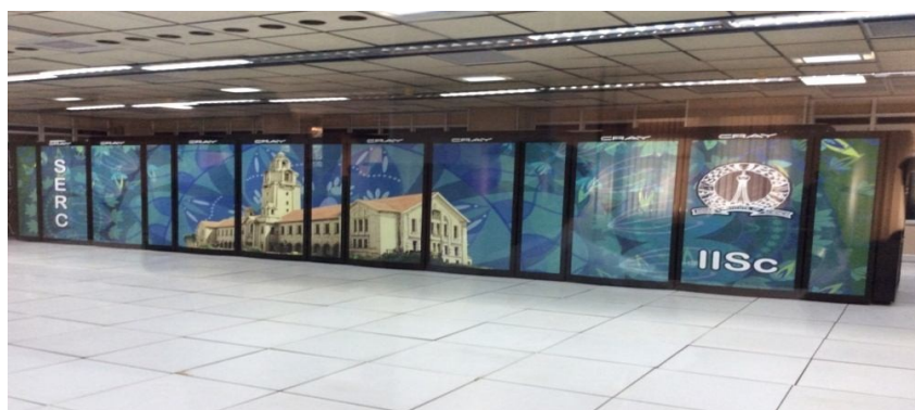
Cray XC40 -India's fastest Supercomputer housed on eight cabinets of 1506 nodes, 1.45PFLOPS and four cabinets of DDN storage with a 2PB usable space 08-01-2016