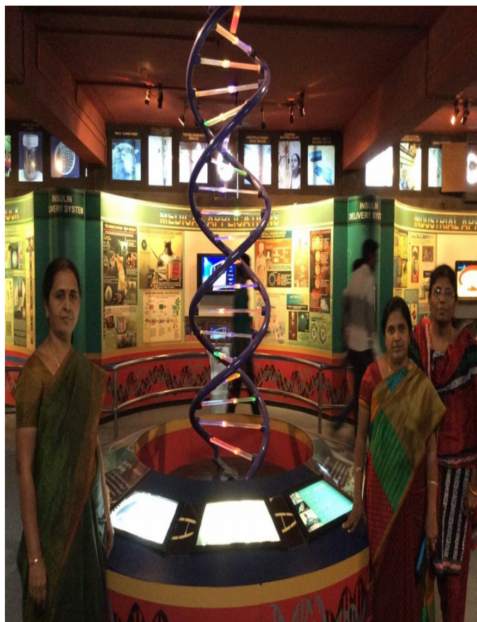
Visveswaraya Industrial and Technological Museum Visiting DNA Structure and Biotechnology Applications 10-01-2016