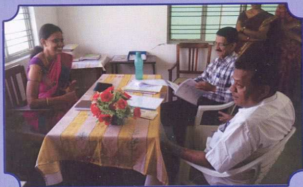
A Snapshot - Commission visit for approval of M.Phil Programme

The Department of Corporate Secretaryship had its inception in 1999 and the masters was introduced in 2011. Part-time M.Phil Programme is introduced in ensuing academic year and Corp Nikites emerges as a Research Department from 2016-17 onwards. The curriculum is regularly updated with due concern to the regional employability as well as to corporate employability by our UG and PG Academic Committee. The department has 9 dedicated and dynamic faculty members. The department has given a special emphasis on entrepreneurial skill development and provides a comprehensive exposure to procure jobs in reputed organisations. To make this aspirations come true, various activities are carried out through the Association of Corporate Secretaryship (Corp Nikites).