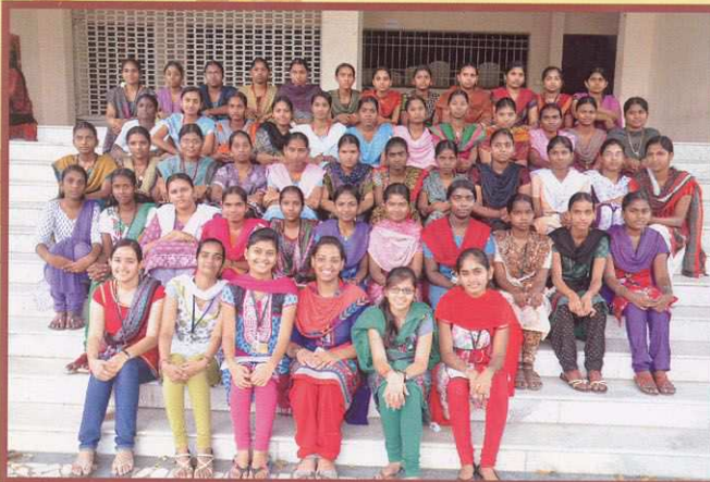
II B.Com (cs)