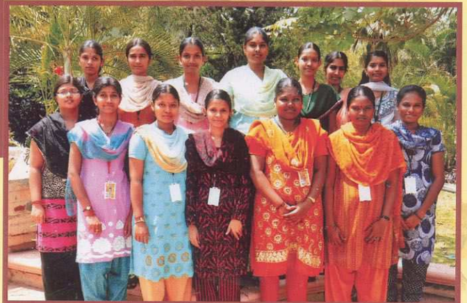
II M.Com (cs)