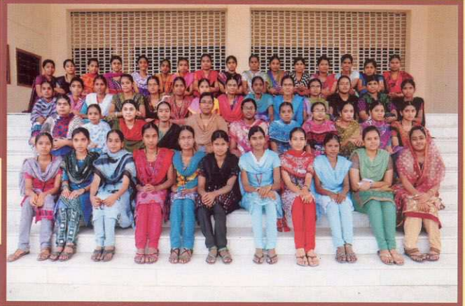
I B.Com (cs)