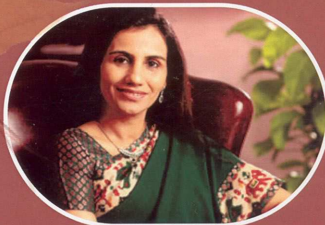
Chanda Kochhar CEO & Managing Director, ICICI Bank