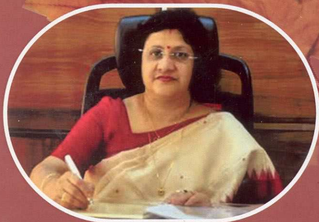
Arundhati Bhattacharya Chairperson, SBI