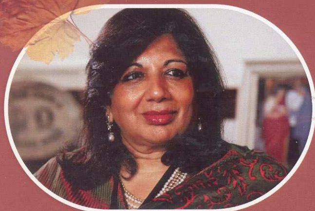
Kiran Mazumdar-Shaw Managing Director, Biocon