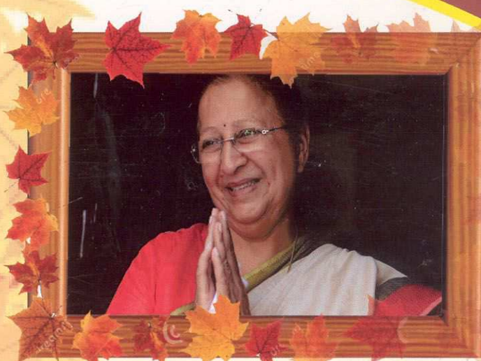
Ms. Sumitra Mahajan