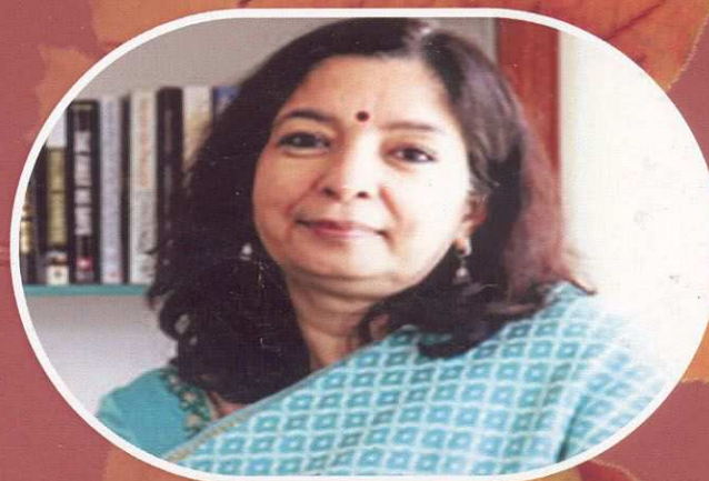
Shikha Sharma CEO, Axis Bank