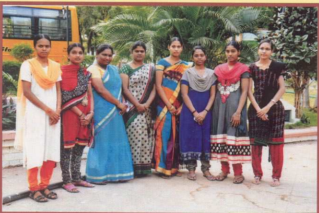
I M.Com (cs)