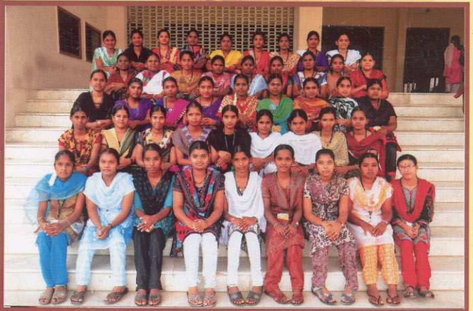
III B.Com (cs)