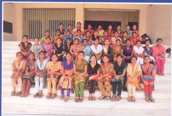
III B.Com (CS)