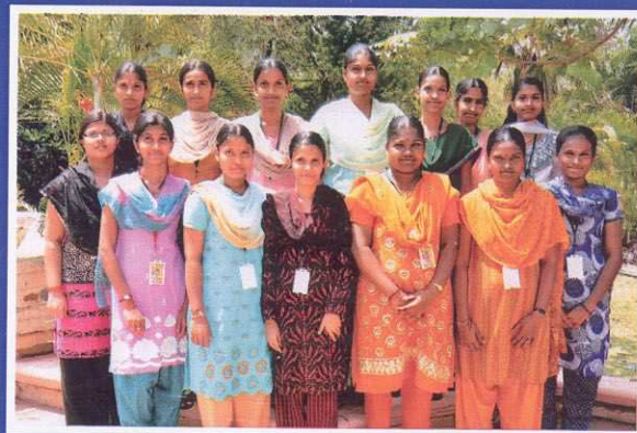
I M.Com (CS)