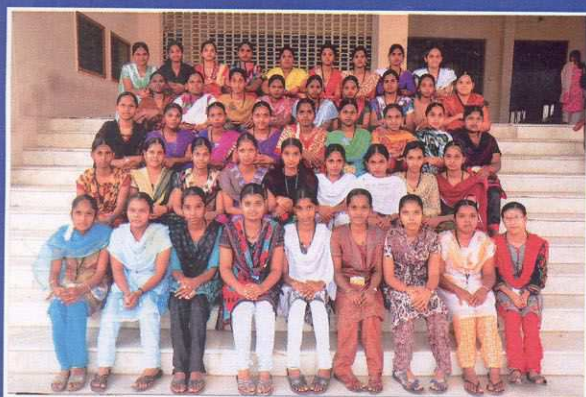
II B.Com (CS)