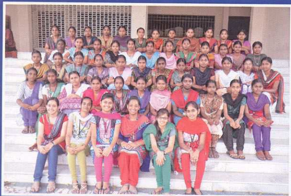
I B.Com (CS)