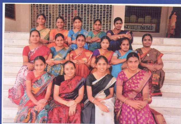
II M.Com (CS)