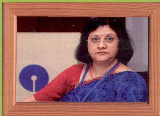
Ms. Arundhati Bhattacharya