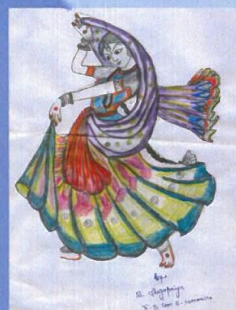
B.Sugapriya II-B.Com (E-Commerce)