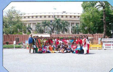
Parliament - New Delhi