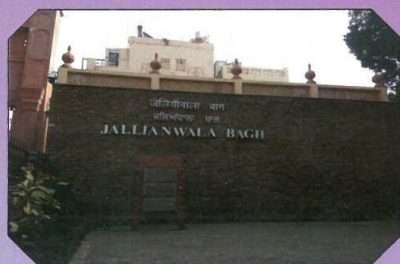
Jallianwala Bagh - Amritsar