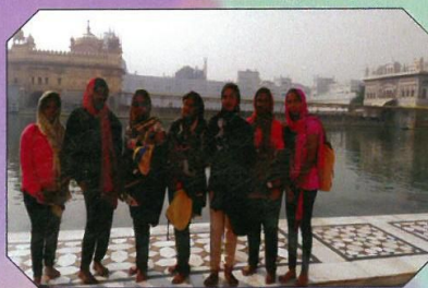
Golden Temple - Amritsar