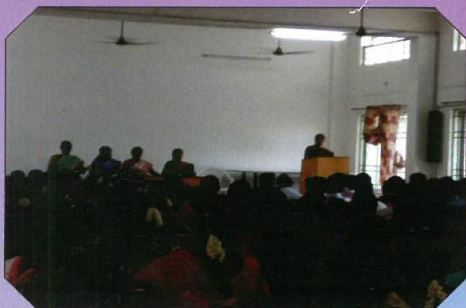
Orientation program for First year students and parents on 16.06.2017