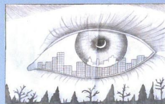
R.Mouluka I-B.Com (CA) 'B'