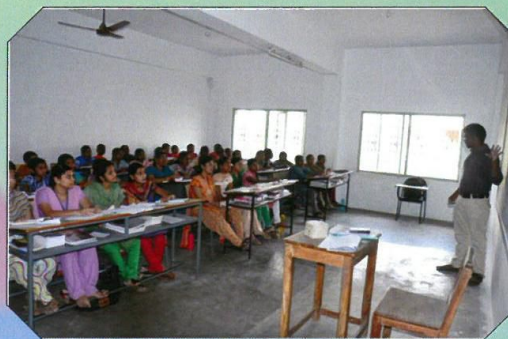
Competency based TNPSC exam coaching classes from 19.12.2017 to 21.12.2017.