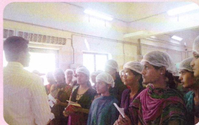
Training on "Recent Trends in Food Processing", at Indian Institute of Crop Processing Technology (IICPT), Thanjavur (14.02.2015)