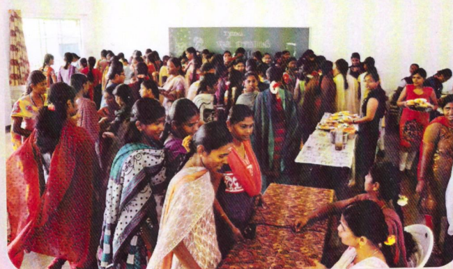
₹ 30000/- worth products were traded in this Exhibition cum Sale (2 nd & 3 rd , March, 2015)