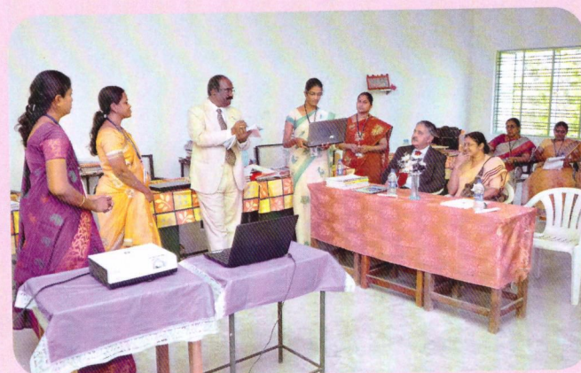
Peer Team Members assessing the department activities (8 - 10, January, 2015)