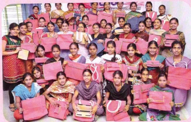
Skill acquired by the Final year students (4 th & 5 th , February, 2015)