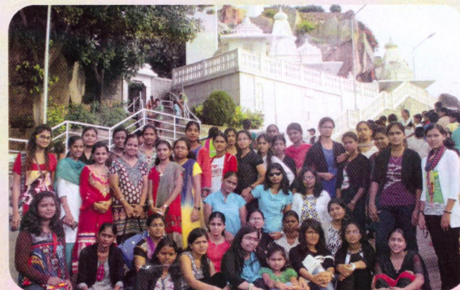
Birla Mandir, Hyderabad (24 - 28, September, 2014)