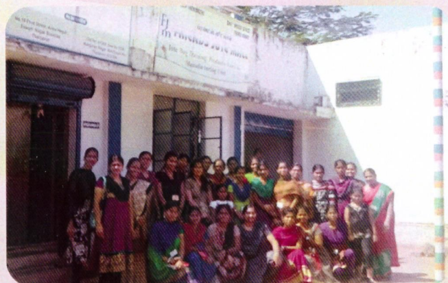
Friends Jute Mall, Thanjavur (14.02.2015)