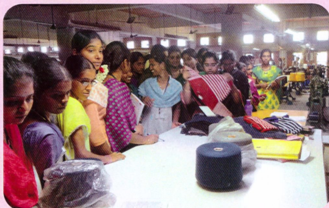
Excel Deals, a Sweater Manufacturing Unit, Tirupur (16.08.2014)