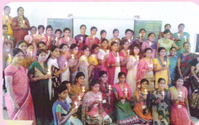
Adieu to Final year students (09.04.2014)