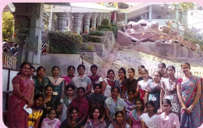
Final year students accompanied by 2 faculty members to count hundial offerings (18.02.2015)