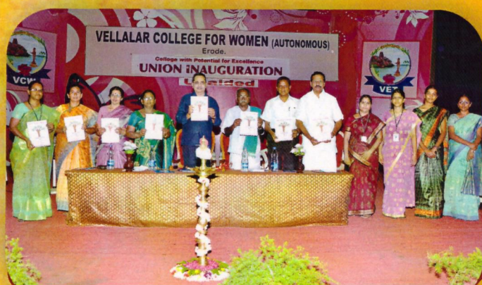
Release of the Department Publication