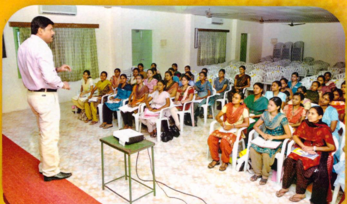
Personality Enhancement- III year