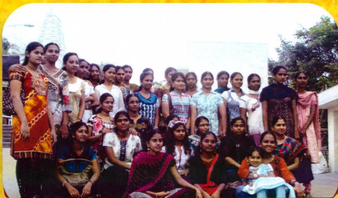
Memorable days at Hyderabad