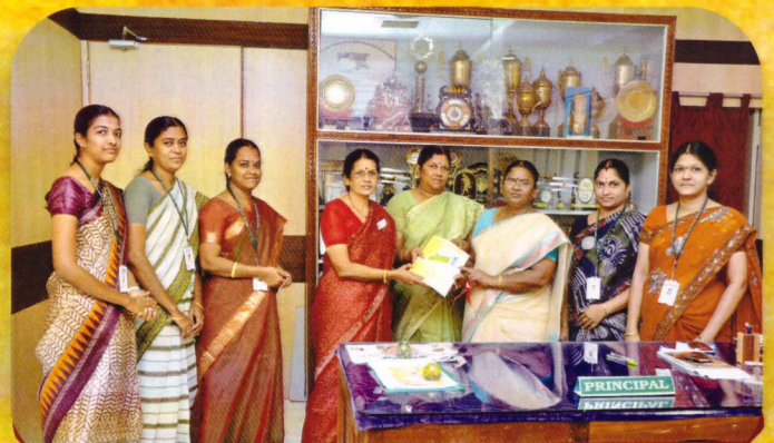
Release of the Text book on "Women and Rural Entrepreneurship"