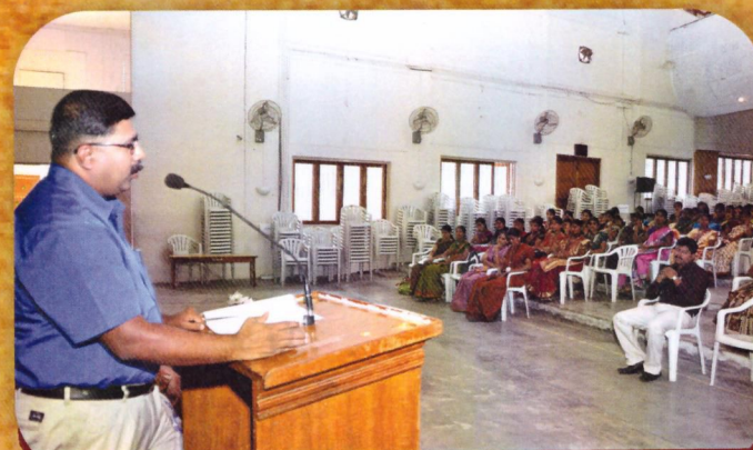
Sharing experiences - TYCOON Valediction