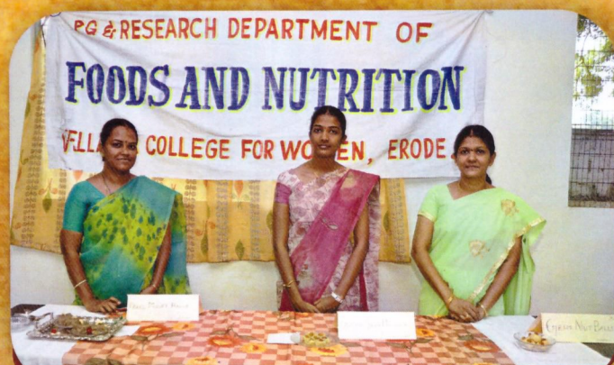
Contesting with Delicious Sweets