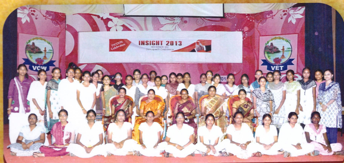
Busy Bees - II BBA (CA)