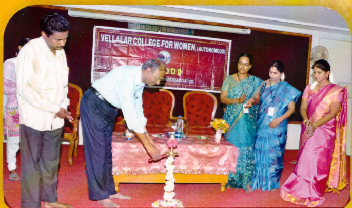
Lighting Ceremony - TYCOON Inauguration