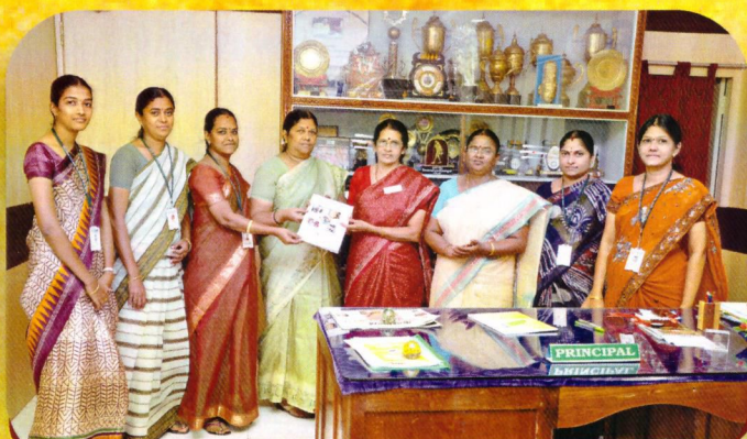
Release of the text book for SBS-II