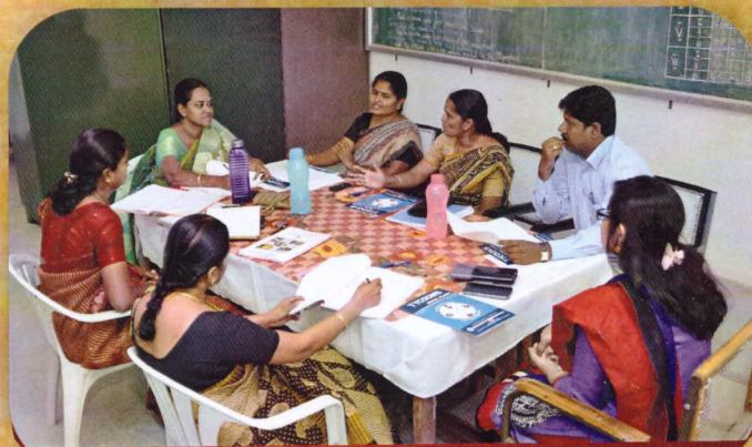
Curriculum approval - Board of Studies Meeting