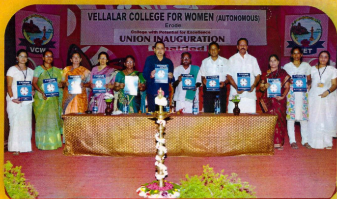
Release of the Yearly newsletter " TYCOON's News Flash"