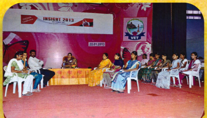
"INSIGHT-2013" - Brain Storming Session