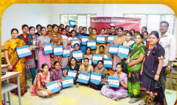
Display of own creation