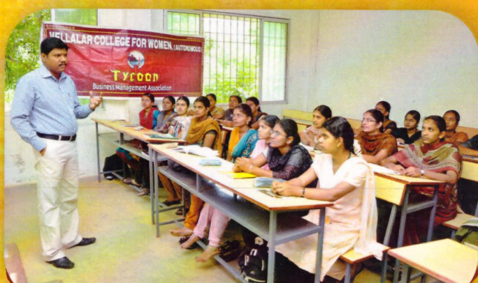
Empowerment through soft skill development - II year