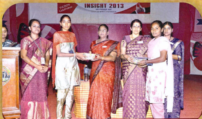
'INSIGHT - 2013' - Prize Distribution