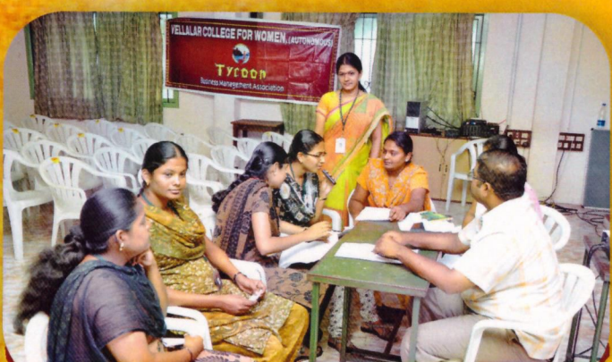
"Voices on the Air"- A radio programme