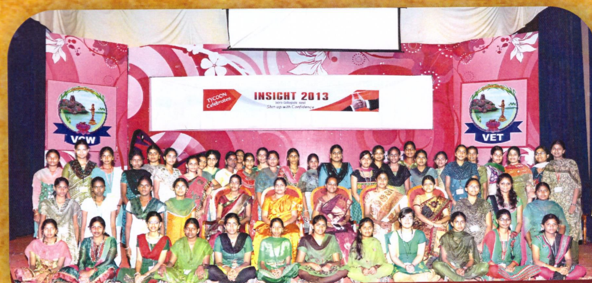
Rising Royals - I BBA (CA)