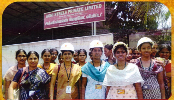
Visit to "AGNI STEELS Pvt. Ltd.,"