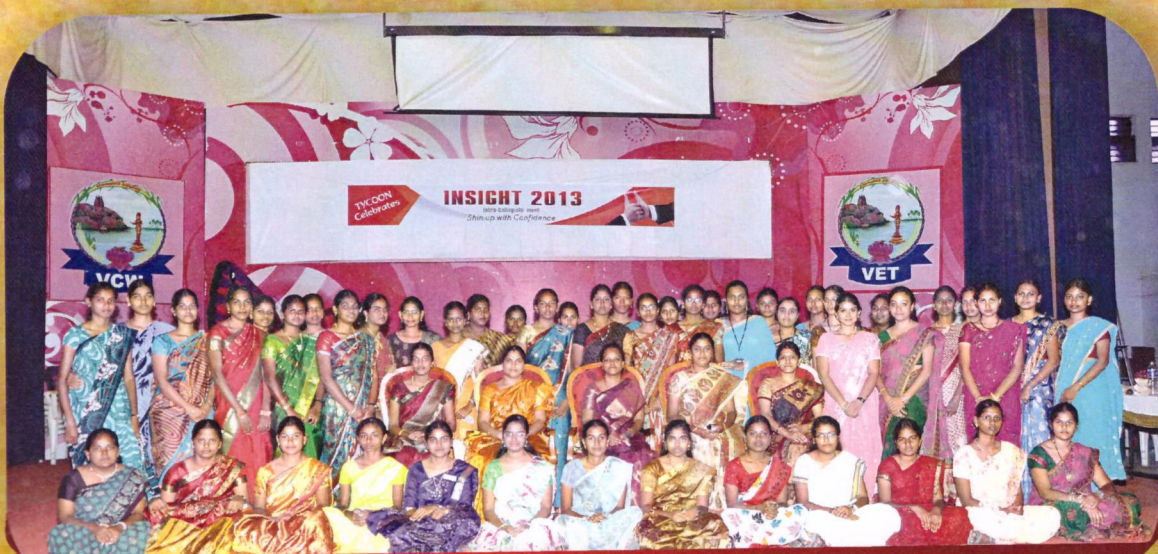
Tomorrow's Tycoons - III BBM