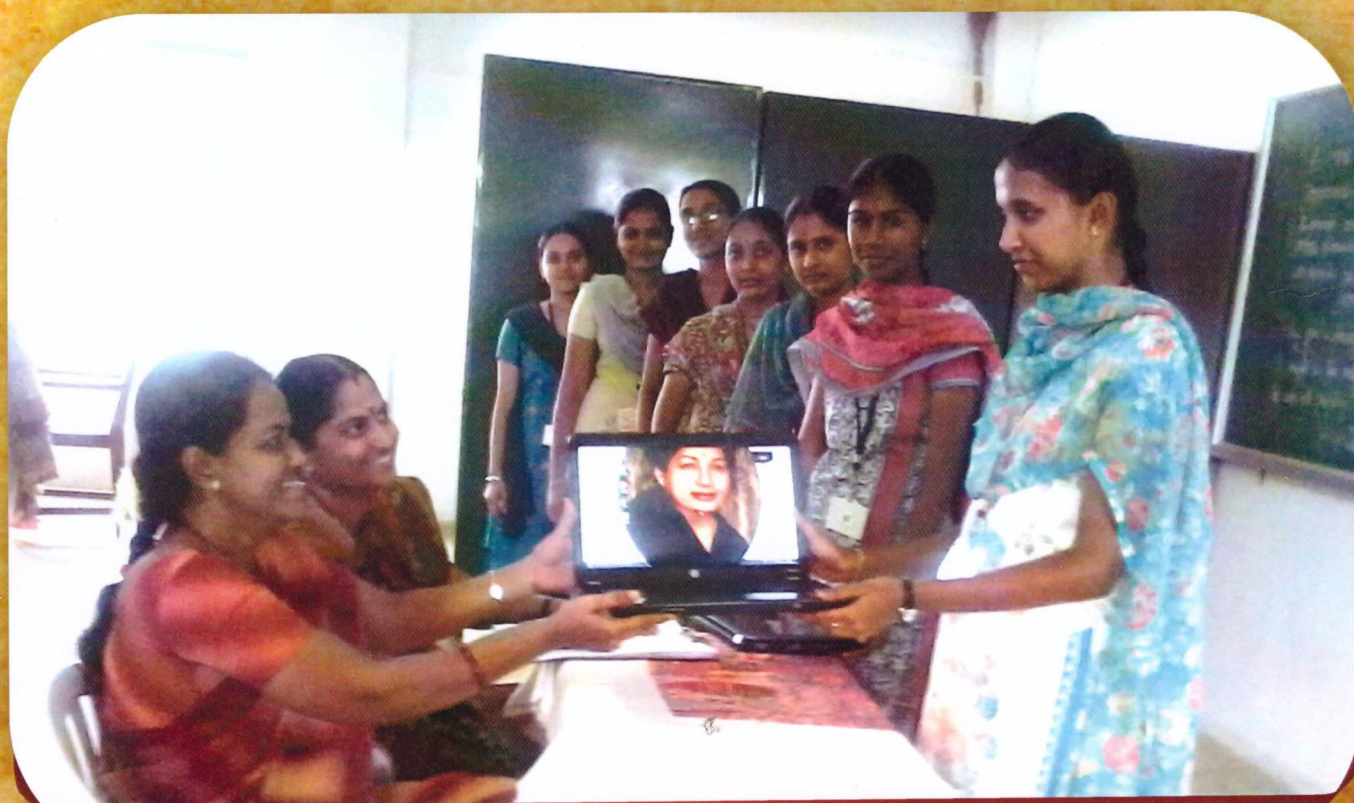
Issue of TN Government's free Laptop