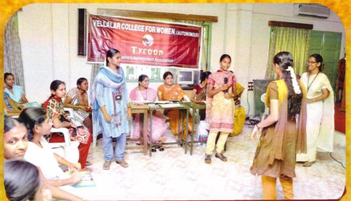
Facing Challenges- Competition under TYCOON