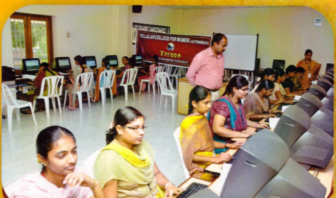
Workshop on Tally