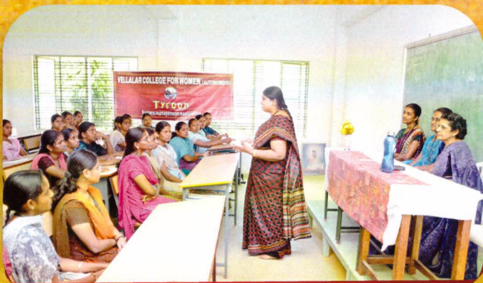
A Chat with an Entrepreneur