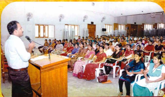
Workshop on "Recurrent Banking Transactions"